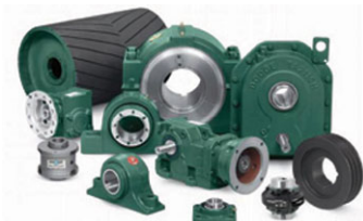
ABB has recently announced that it has awarded ASGCO's Mid-Atlantic Division, as a fully authorized distributor of DODGE Bearings and Power Transmission Products for the states of Maryland and Virginia. This expands ASGCO's existing distribution territory of Pennsylvania, Delaware and Southeastern New York to give the end-user customers and original equipment manufacturers (OEM's) an independent distributor choice for their power transmission product needs.

ASGCO's Mid-Atlantic Division is now a fully authorized distributor of DODGE mechanical power transmission parts including mounted bearings, enclosed gear reducers, brakes, clutches, conveyor parts, belts, couplings, the industry standard, are designed to perform successfully in the most rugged environments and with the lowest total cost of ownership over the lifetime of the product.