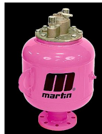
MARTIN ENGINEERING—BREAST CANCER AWARENESS PROGRAM!