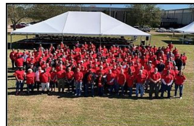
SYNTRON MH—CELEBRATES 3-YEARS WITHOUT A LOST TIME ACCIDENT!