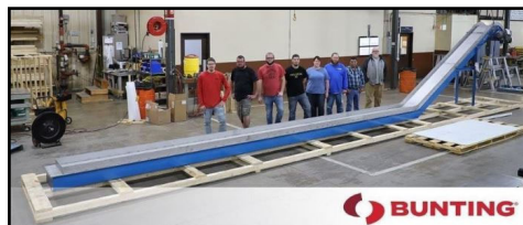
BUNTING MAGSLIDE CONVEYOR