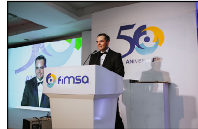
FIMSA CELEBRATES 50TH ANNIVERSARY!