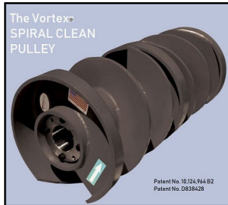
DOUGLAS MANUFACTURING— AWARDED TWO PATENTS!

The TIMKEN Company Celebrates their 120th Anniversary by ringing the NYSE Closing Bell! Congratulations!!