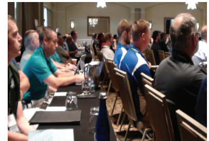
CEMA Engineering Conference

If you do, then contact CEMA about membership and I look forward to seeing you at the CEMA Engineering Conference.