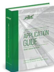
CEMA Unit Handling Book