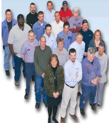
LEWCO, INC. TEAM