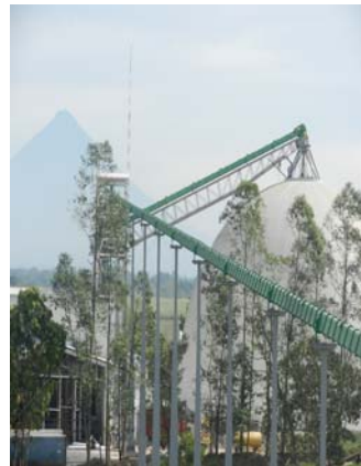
30" x 751" HoverTube Conveyor

Charlotte, North Carolina – Jim Myers & Sons, Inc., established in 1962, with over 50 years of experience has become a nationally recognized equipment manufacturer leading the way in the municipal water & wastewater industry. Click here to continue reading.